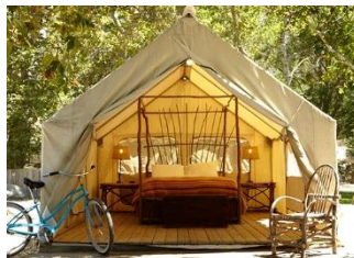
Glamping and campsites