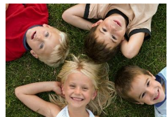
Children's play area