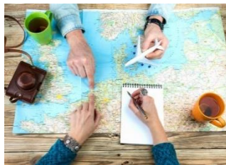
Programme of talks on trails and travelling