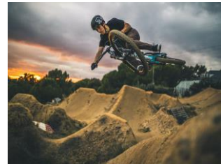
Adventure and outdoor sports