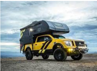
4x4 camper vans