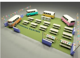
Gastronomic tasting area