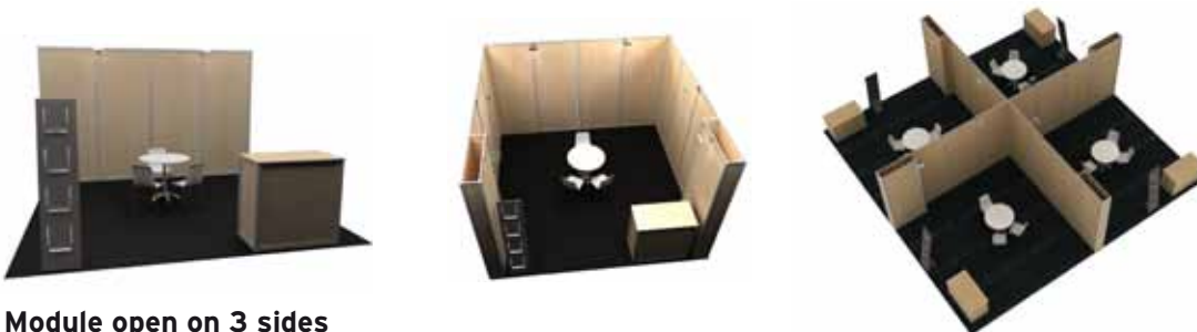
Module open on 3 sides