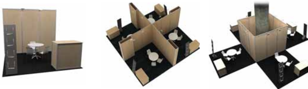
Module open on 1, 2 or 3 sides