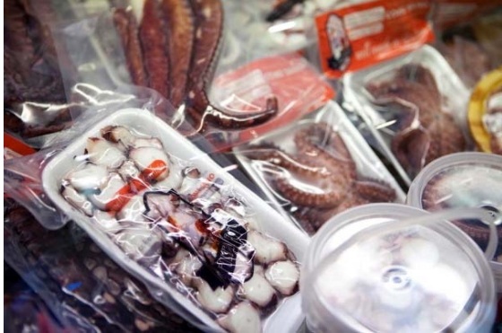
es in the Mexico

Pre-prepared food, ready-to-eat products, canned and frozen food are gaining popularity in Mexico as a result of lifestyle changes, the incorporation of women in the workplace and the increased income per capita. In addition, rising income levels represent increasing opportunities to buy imported foods.